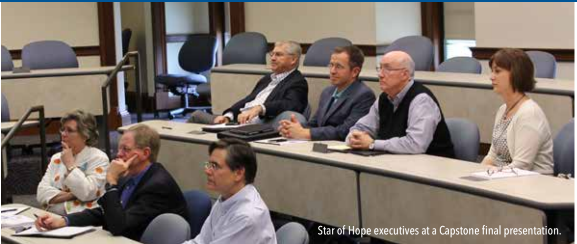
Star of Hope executives at a Capstone final presentation.