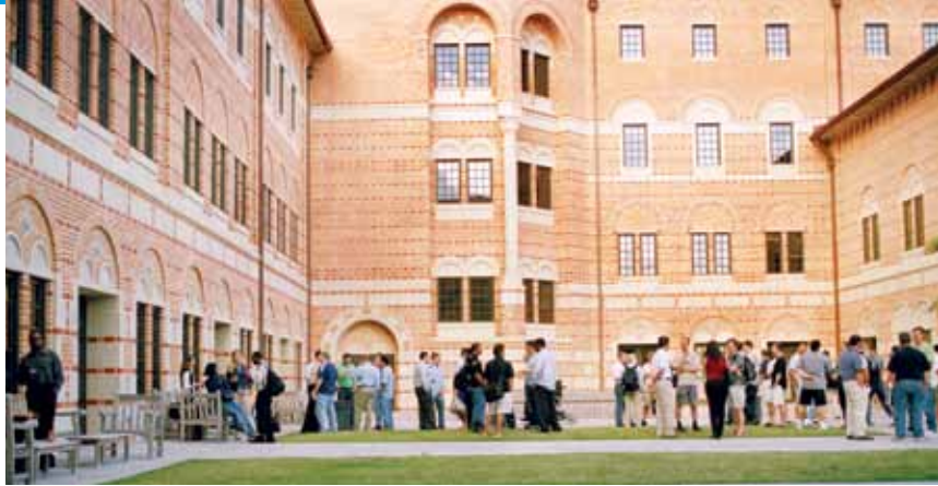
Woodson Courtyard at McNair Hall